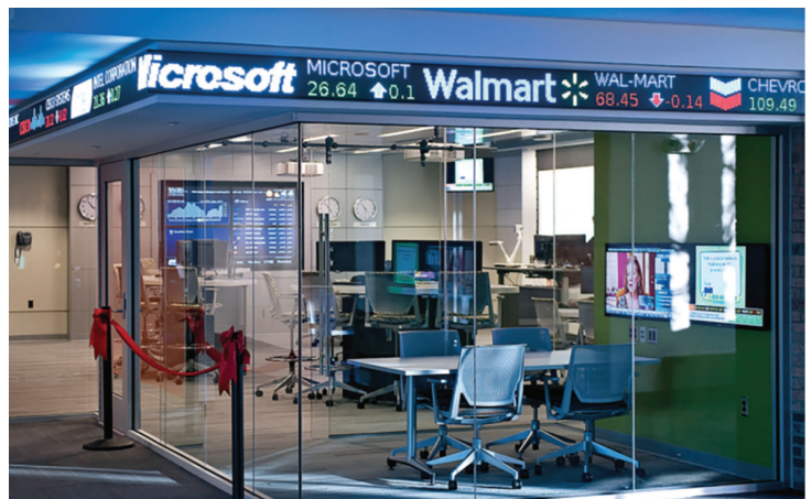
Example: Walsh College in Michigan